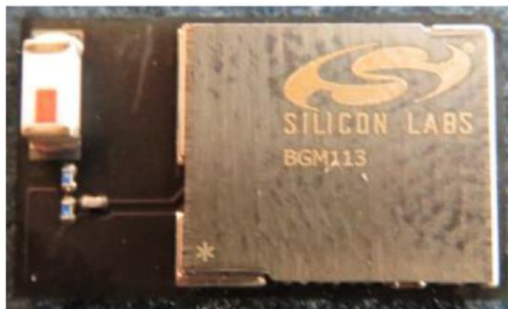
Figure 1 BGM113 top